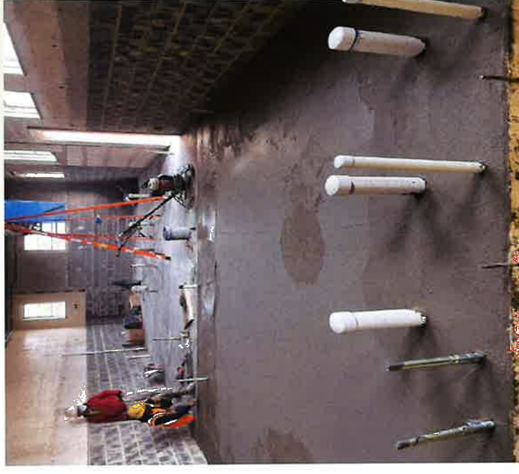
Locker Room Partial Floor Poured