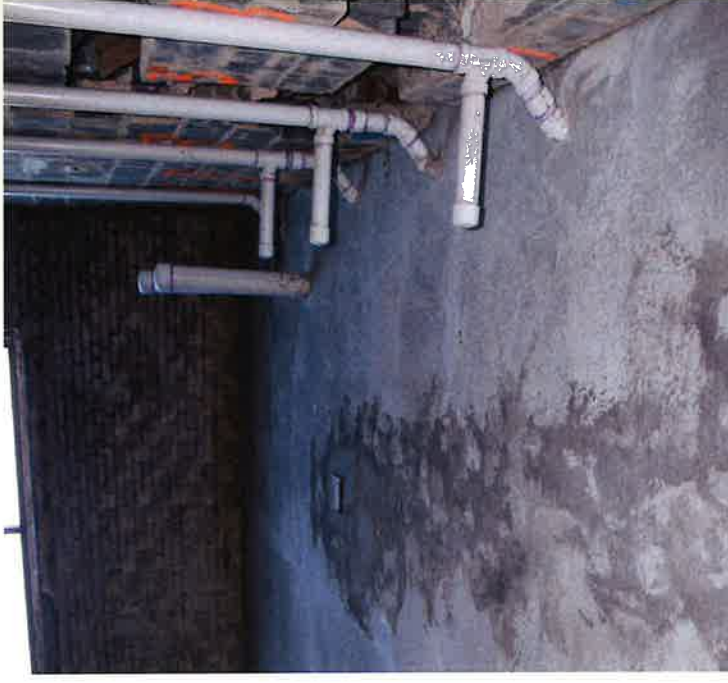
Poured Floor Men's Restroom