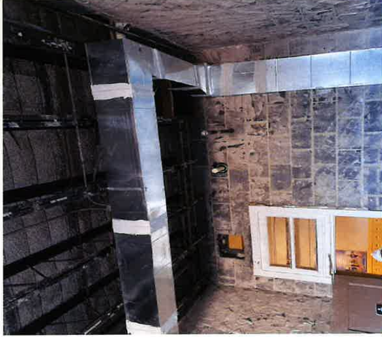
Duct Work Men's Restroom