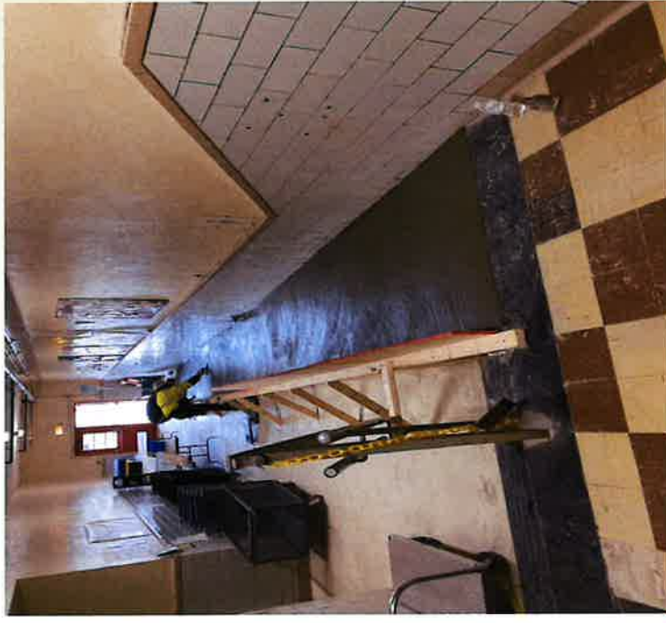
Ramp Poured Food Bank