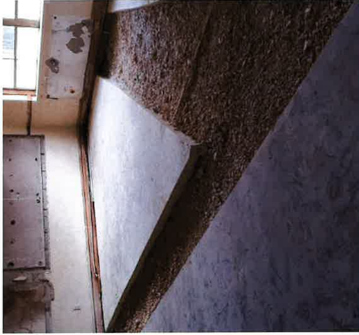
Trenching Electrical Room