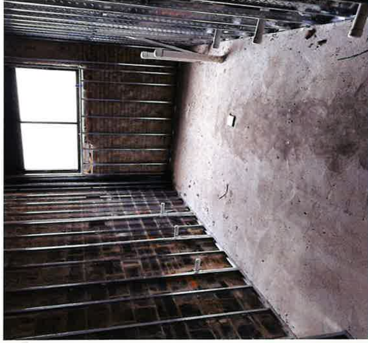
Framing Men's Restroom