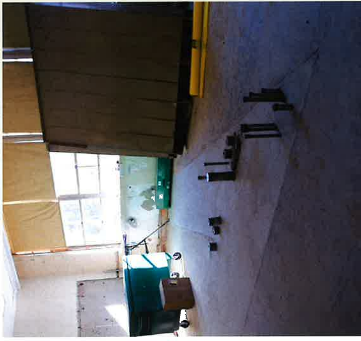
Poured Floor Electrical Room