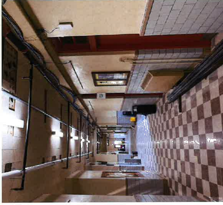
Fire and Water Mains in Main Corridor w/Insulation On Water Main, Sprinklers and Electrical Conduit Installed