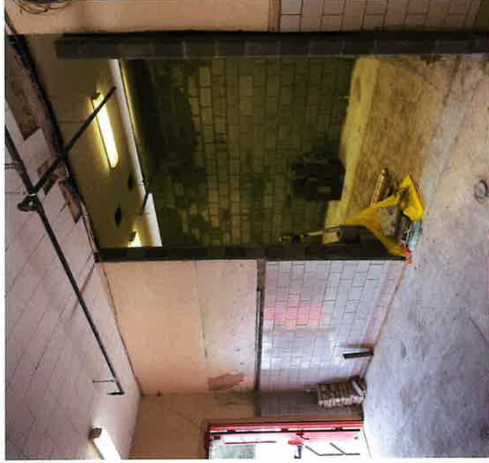
Masonry Work Electrical Room