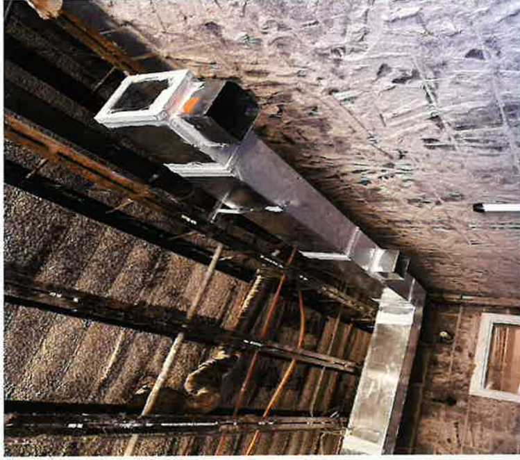
Duct Work Women's Restroom