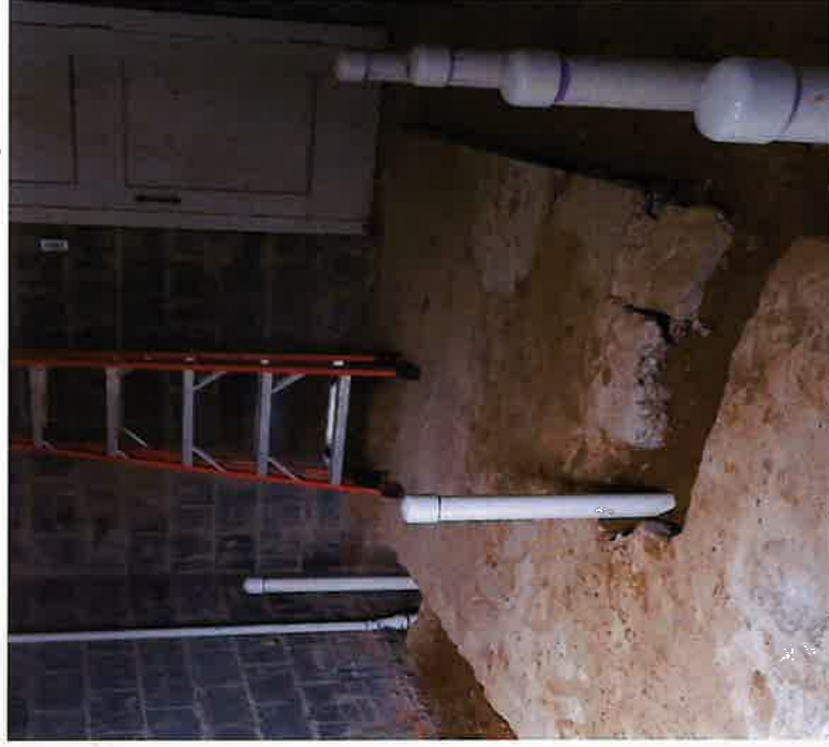
Rough-In Plumbing Women's Restroom