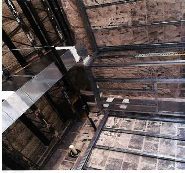
Framing & Duct Work Men's Restroom