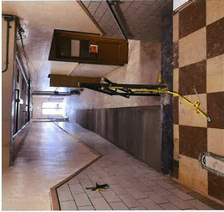
Ramp Poured Near Door #10