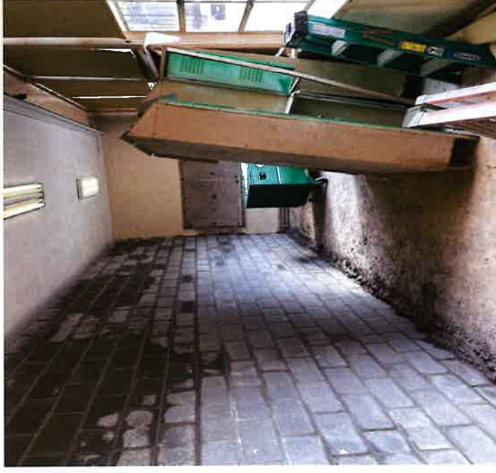
Masonry Work Electrical Room