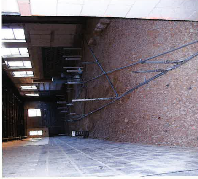
Locker Room Prepared for Concrete Floor Pouring