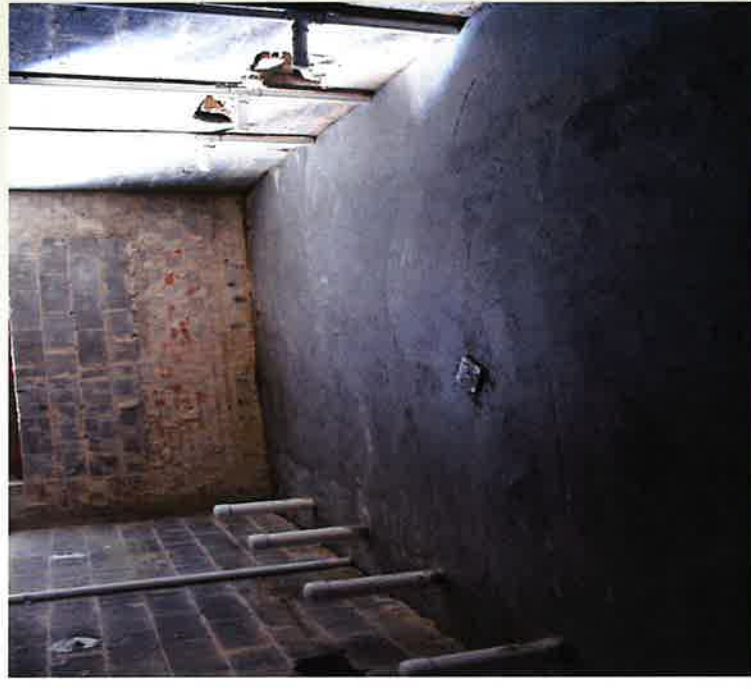
Poured Floor Women's Restroom