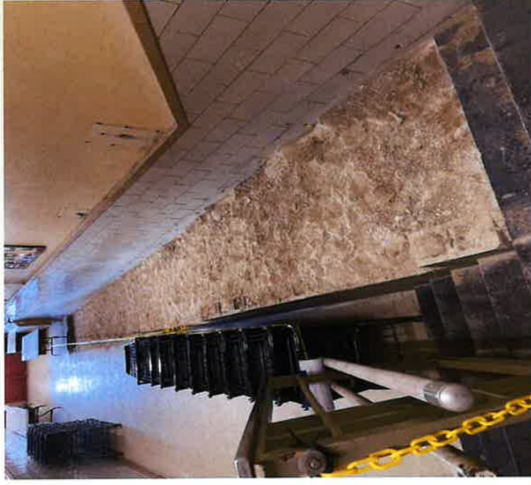
Ramp Demo Food Bank