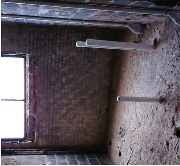
Rough-In Plumbing Men's Restroom