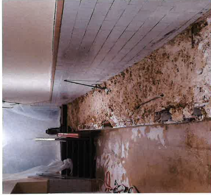
Ramp Demo Near Door #10