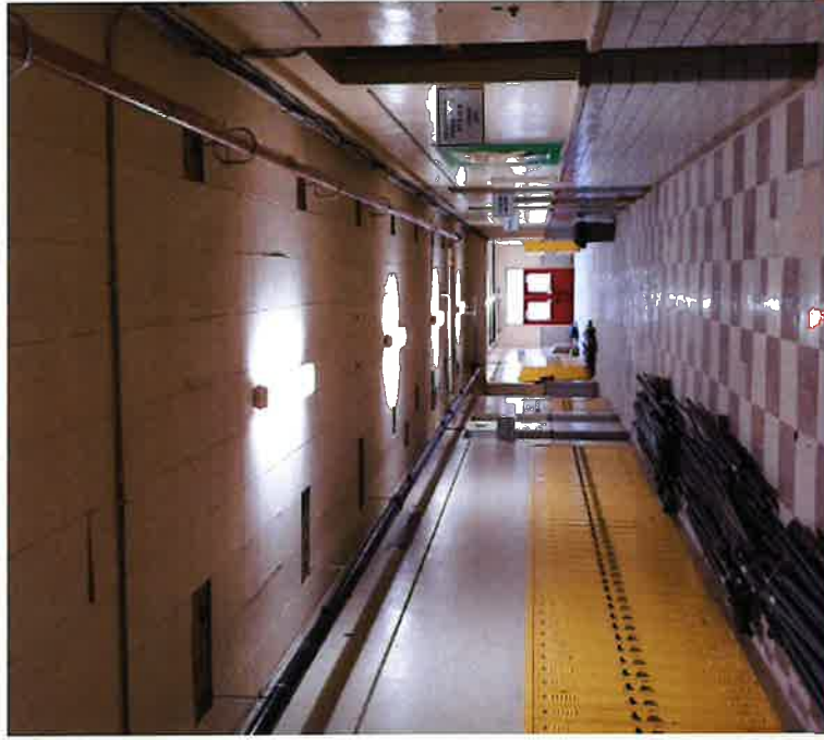
Fire and Water Mains Main Corridor