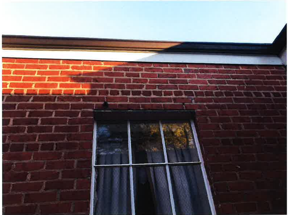
EXHIBIT A Exterior Images