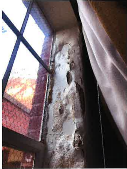
EXHIBIT B Interior images