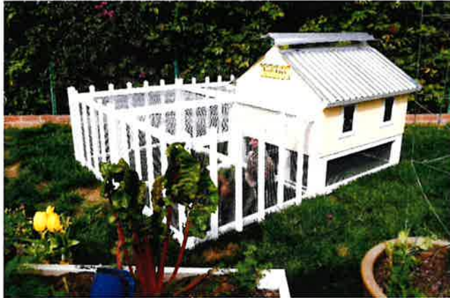
Small coop with small run