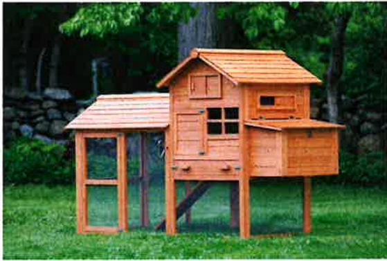
Small coop with attached run.