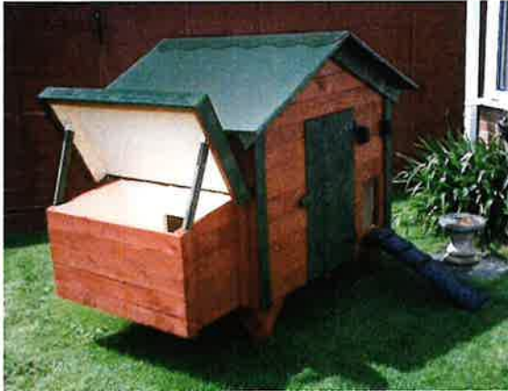
Coop built out of recycled pallets