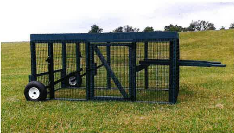
Movable chicken run