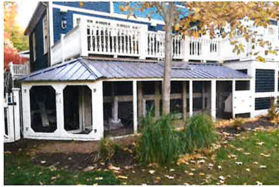
Large coop and run, attached to house