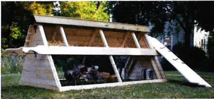
Mobile chicken coop, or chicken tractor